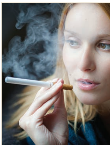
PHOTO 1: E-cigarettes do not produce a vapor (gas), but rather a dense visible aerosol of liquid sub-micron droplets consisting of glycols, nicotine, and other chemicals, some of which are carcinogenic (e.g., formaldehyde, metals, nitrosamines).

samplers from an e-cigarette attached to a mechanical smoking machine. For our exposure analyses we included seven of the 11 chemicals studied by Goniewicz